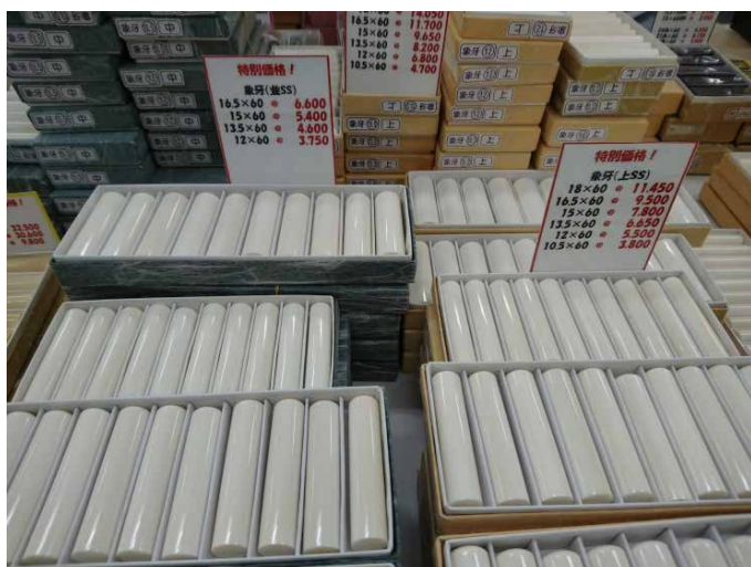
Ivory hanko (name seal)

On the domestic ivory market front, management is based on the Law for Conservation of Wild Fauna and Flora (LCES), which mainly focuses on preventing smuggled ivory from entering the market. 12 Accordingly, the LCES rule is virtually useless for prevention of illegal export of ivory. Therefore, as a measure to prevent ivory export, the Government of Japan (GoJ) started a campaign in collaboration with the private sector to make people aware of the illegality of ivory export. GoJ “sent a notification in November 2017 on prohibition of ivory import/export to the concerned organizations and kept tourists informed about the prohibition at its major airports.” 13 As a follow-up to the campaign, in March 2018, the Government of Japan also held several seminars nationwide about the amendment to LCES 14 and put the concerned businesses on notice about the importance of preventing illegal export of ivory. 15 The effectiveness of the awareness efforts, however, was brought into question by EIA after it investigated hanko shops in 2018 and found many shops attempted to sell ivory hanko knowing the customer intended to export it. 16 Though the efforts to raise awareness lasted for almost three years, a follow-up investigation by EIA/JTEF in 2020 revealed that close to 40% of the hanko shops which had refused to sell an ivory hanko in 2018, knowing the customer intended to send it abroad, have reversed their position, now offering to sell an ivory hanko under the same circumstances. 17