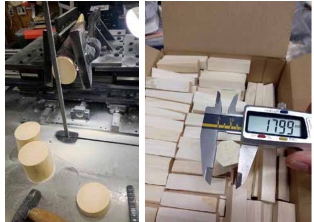
In this workshop, the trader cuts registered whole tusks into pieces in designated sizes and stockpiles these for production of standard items.

This ivory trader would purchase registered whole tusks in Japan, keep them in their basement storage temporarily and then bring them into this workshop. The tusks are then cut into pieces in a prismatic shape with designated sizes, stockpiled and then carved into a variety of items including ready-made items regularly sold to Chinese tourists.