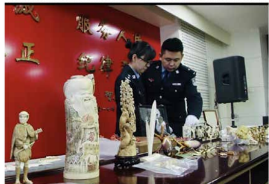
Source: “Special toy turned out to be ivory – investigations against online ivory smuggling - Legal Daily Newspaper, April 17, 2019.”

Despite insistence from Japan that its domestic ivory sales are not contributing to the illegal trade, the above-mentioned cases clearly indicate that there is a major flaw in the prevention of illegal ivory flows from Japan to overseas destinations. The biggest challenge for Japan Customs is that, on the one hand, it must satisfy a swifter customs clearance of people and goods, and on the other hand, it has to enforce stricter law enforcement in preventing illegal drugs and terrorism-related materials 11 from entering the country. In this context, it is difficult for the border control team to carry out an extended search inspection necessary to effectively detect and seize illegal shipments of ivory set for export.