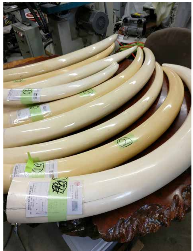
The whole tusks found in the workshop each had the relevant registration cards attached

She underscored, “In fact, it is easier for me if you buy a whole tusk. I can even give you discount on the cost for carving the tusk. All the rest of the parts after carving belong to you. You can take them and do whatever you want to do to them.” This indicates that customers who make an order for such ivory crafts are required to pay the cost for a whole tusk as well as the carving fee. The manager also stated, “I only buy ivory with original certification [registration card].” In fact, both the tusks in the retail shop as well as those in the workshop all had the relevant registration cards attached, as far as the investigators could tell. Certainly, this trader intended to comply with LCES when they bought the ivory as a raw material.